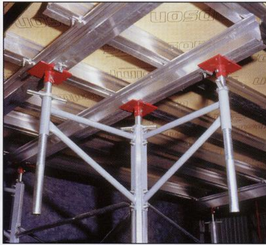
SLAB EDGE CANTILEVER BRACKETS ALLOW FOR PERIMETER SLAB EDGE DECK